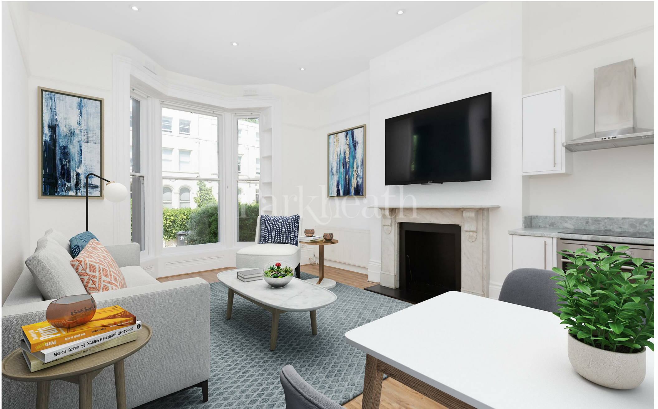
Priory Terrace NW6